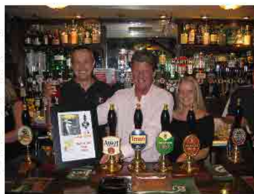
Smile for the cameras ladies and gents!

The pub nestles in St. John's Close, a small road off the high street, between seafood restaurant Loch Fyne, and the Pizzeria Napoletana, a café-cum-restaurant. It is a small, cosy friendly pub, with various seating areas on one level, and looking round one finds a wealth of memorabilia displayed in cabinets and on the walls. Six real ales plus a real cider are available at all times, plus the pub does occasional independent beer festivals.