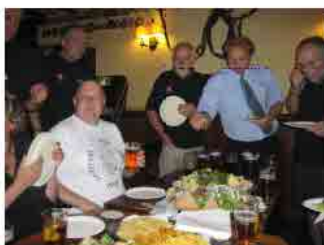
A very welcome snack

Burton Ale, Tetley's Best Bitter, Ansell's Mild and Greene King IPA all feature, plus two regularly changing guest beers often from small breweries. The pub takes a pride in how the beers are kept, and a glance round the walls will reveal old pump-clips that show the range that has been on offer over the years. Of course, the standard range of lagers, wines and spirits are always available, and the pub does bar meals between 12 and 2, Mondays—Saturdays, with bar snacks available at all times. Visit in December and you may stumble upon the Pickled Onion Competition!