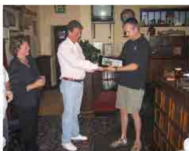
A well-deserved presentation

On the 5th July, members of Solihull & District CAMRA gathered together at The Vaults in Knowle, to witness the handing over of a certificate to mark their winning our branch's 'Pub of the Year' competition for 2006.