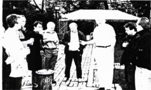
Leatherbitches Brewery talk...

Solihull CAMRA recently took the high road to the Peak District for a minibus day trip to the best pubs in the area. Our first stop took us through Ashbourne to the pretty village of Fenny Bentley known for its brook and trout fishing. The Bentley Brook Inn is a large country pub known for its superb views, good food, regular beer festivals and Leatherbitches Brewery beers which are brewed at the rear of the premises. Today we tasted Belter and Bespoke Bitters both very quaffable, even at eleven in the morning. The brewer and owner gave us tall and amusing tales of the brew house and then it was back to Ashbourne and on to Hulland Ward.