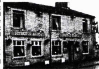
The Rams Head, home of Ryburn Brewery