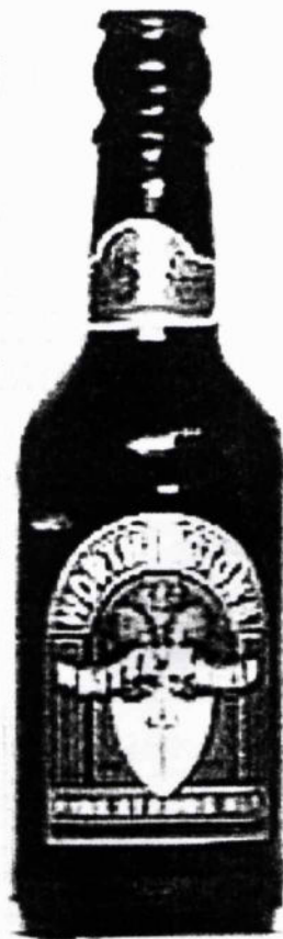
Worthington White Shield a classic bottle conditioned beer absent from supermarket shelves